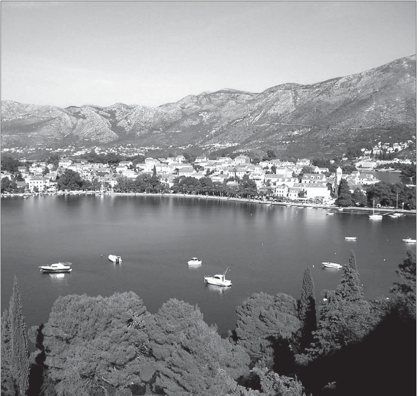
Venue of the second international conference Laboratory Competence to be held in 2007 at Cavtat, Dubrovnik, Croatia.